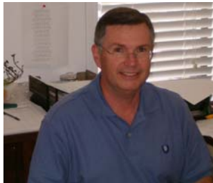
Service with a smile!